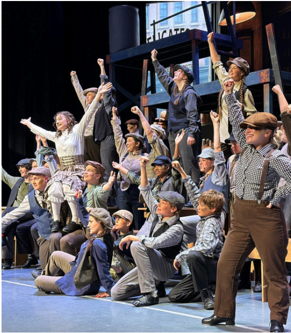
HCA's production of "Disney's Newsies" Summer 2025