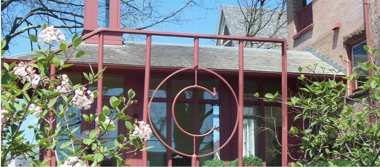
The Cary House, home of the Holmes County Foundation