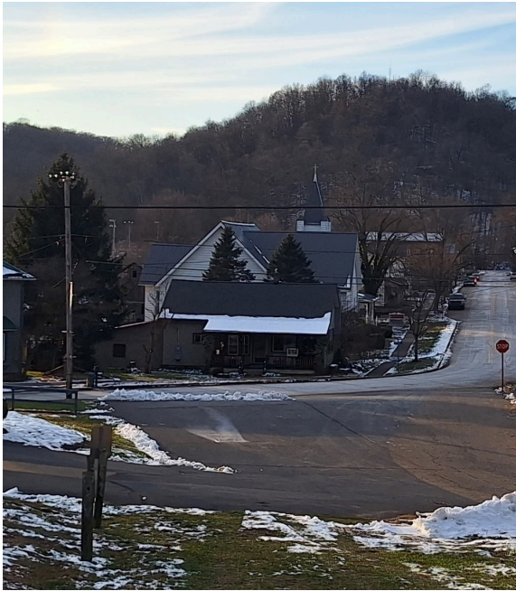
A view of Glenmont