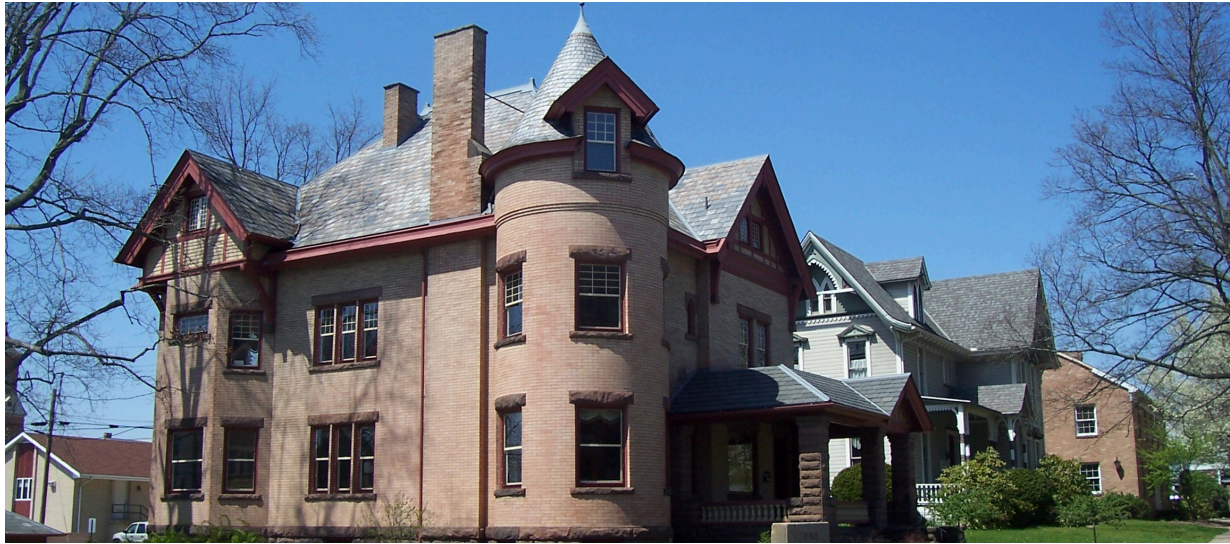
The Cary House, home of the Holmes County Education & Community Foundation