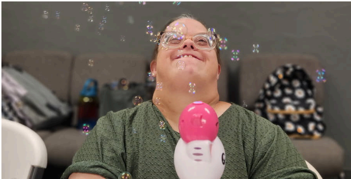
Client of Sacred Ground, an HCECF partner agency